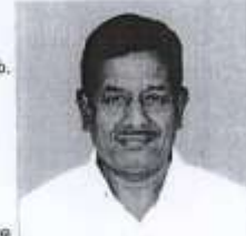
புதுவை பாரதியார் கிராம வங்கி கிராம வங்கி